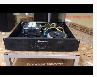
Crown xls 2500 power amplifier review.